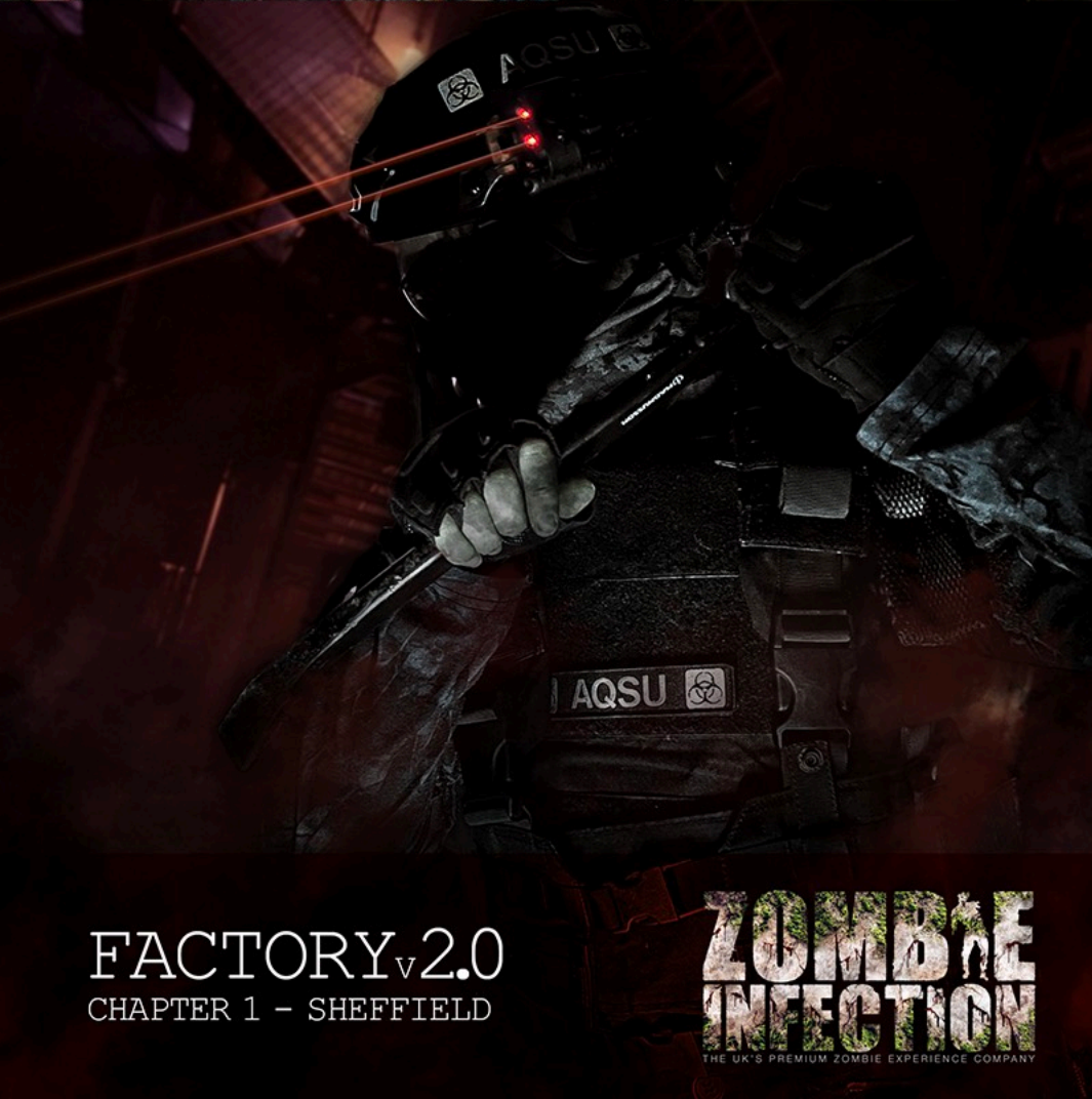
FACTORY v2.0 CHAPTER 1 - SHEFFIELD

ZOMBÆ INFECTION THE UK'S PREMIUM ZOMBIE EXPERIENCE COMPANY