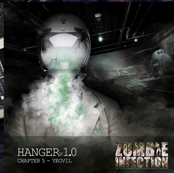
HANGER v1.0 CHAPTER 5 - YEOVIL

ZOMBÆ INFECTION THE UK'S PREMIUM ZOMBIE EXPERIENCE COMPANY