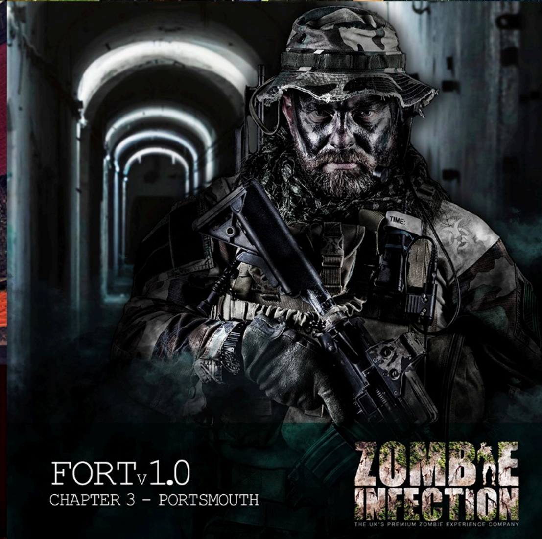
FORT v1.0 CHAPTER 3 - PORTSMOUTH

ZOMBÆ INFECTION THE UK'S PREMIUM ZOMBIE EXPERIENCE COMPANY