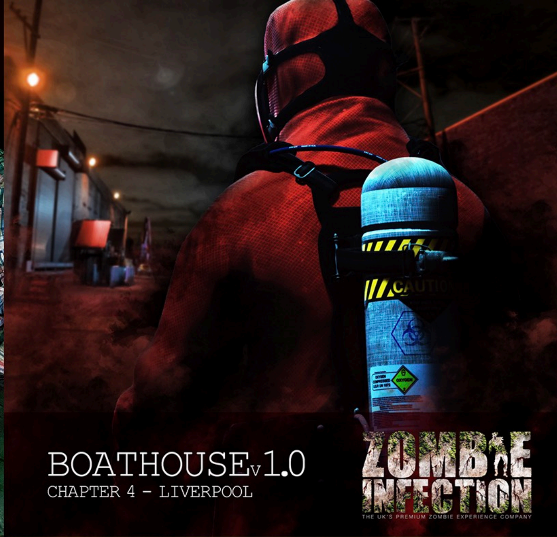
BOATHOUSE v1.0 CHAPTER 4 - LIVERPOOL

ZOMBÆ INFECTION THE UK'S PREMIUM ZOMBIE EXPERIENCE COMPANY