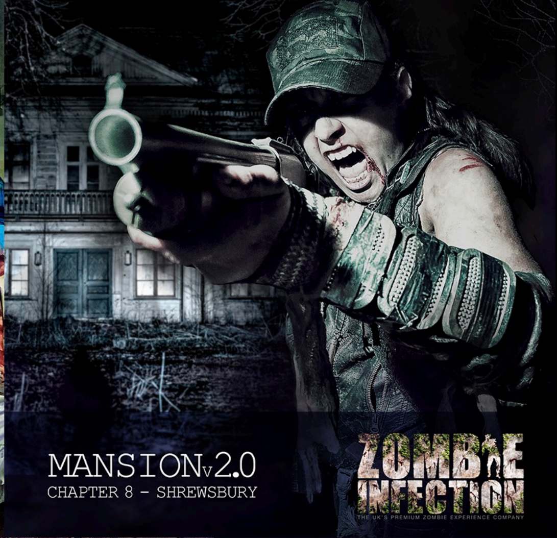
MANSION v2.0 CHAPTER 8 - SHREWSBURY

ZOMBÆ INFECTION THE UK'S PREMIUM ZOMBIE EXPERIENCE COMPANY