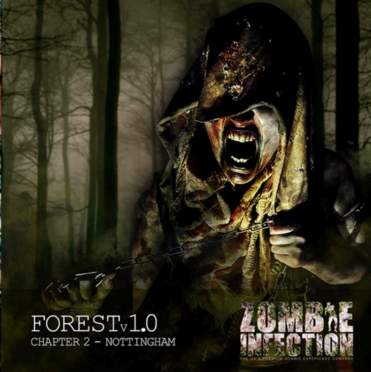
FOREST v1.0 CHAPTER 2 - NOTTINGHAM

ZOMBÆ INFECTION THE UK'S PREMIUM ZOMBIE EXPERIENCE COMPANY